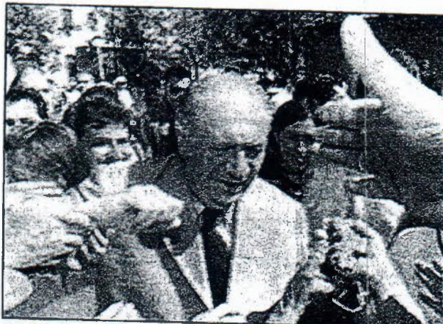
DUE TODAY: Chile President Ricardo Lagos.

Chilean President is to have lunch with CARICOM Secretary-General Edwin Carrington before official talks with Mr