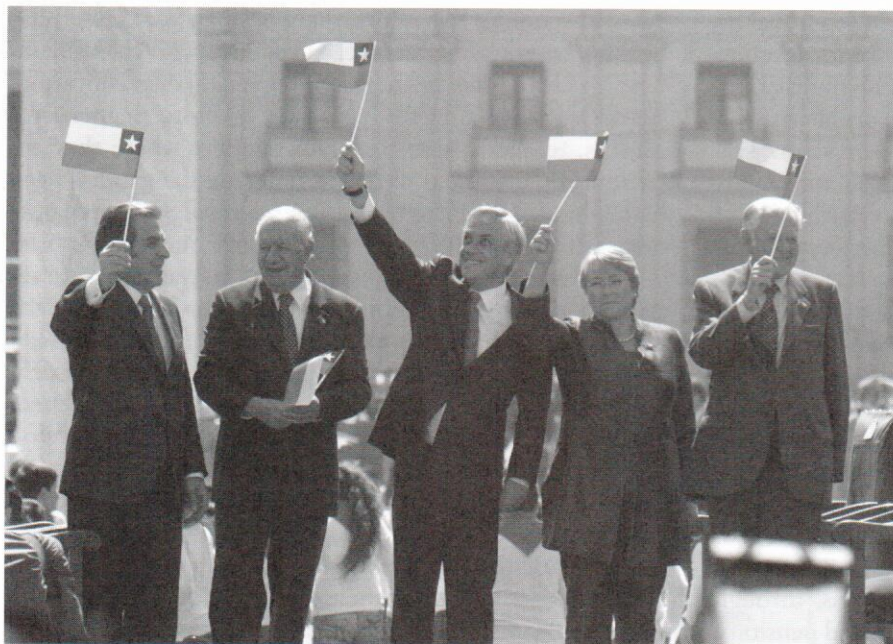
The past five presidents of Chile celebrate the 2010 bicentennial of Chile's independence in front of the Government Palace in Santiago, Chile. Former President Ricardo Lagos appears second from left.

Chile has also made progress in improving the judicial system and promoting cultural development. Regarding the judicial system, a set of reforms promoted transparency in the criminal, labor, and family justice systems. Criminal justice reforms changed the system from the Spanish model to a model similar to that of the United States. The old system was based on written presentations of evidence, and the same judge who investigated the crime was charged with imputing the accused and, ultimately, resolving the case. The new Chilean criminal system is based on oral proceedings and prosecutors presenting evidence in front of a panel of three judges who decide the case. The accused has the right to a public defender. This reform improved the decision-making process by separating the role of the investigator or prosecutor from the role of the judge who issues decisions. The reform has made the criminal justice system more expedient and provides opportunities for settlement before cases go to trial. A conciliation mechanism was also